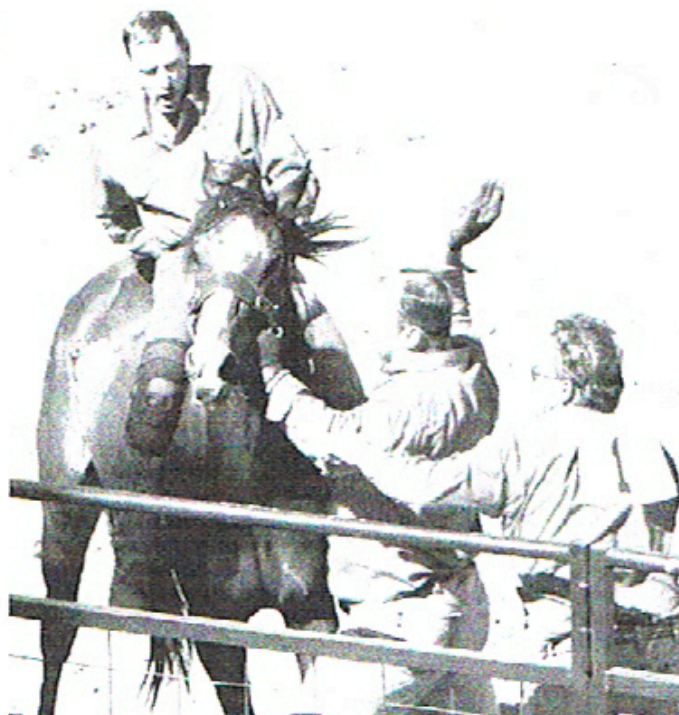
Rodeo thugs hitting horse during "Wild Horse" Event

www.ShameOnCheyenne.com www.RodeoCruelty.com